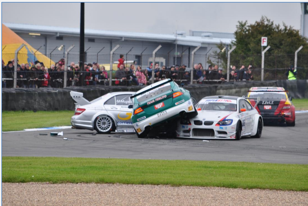
This is how the professionals did it!

Championship race points may be seen at www.fiestajunior.ms