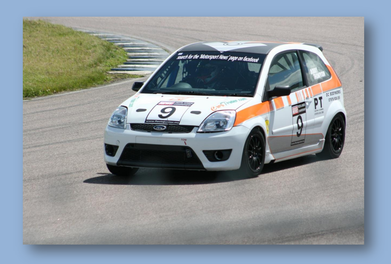
Bobby Thompson shows off his new livery – very eye catching.

Rockingham is an unusual track with differing parts but I was so proud at the way our young drivers acquitted themselves over the weekend. Mostly good driving with a couple of areas of contact which gives ground for concern for spoiling the racing. We have to remember that in karting a touch is just that and mainly sees nothing more than going off track undamaged. The same act in a Fiesta ST is not so easy, as contact = damage and damage may= race stop.