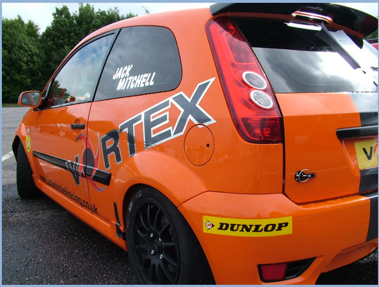
A brand new car in orange livery for Jack Mitchell. Impressive and the attention to detail is amazing.

These results are provisional until the conclusion of any judicial and technical matters. Brands Hatch Indy Circuit Length = 1.2079 mile. Start: 17:02 End: 17:23. Weather / Track : Cloudy / Dry